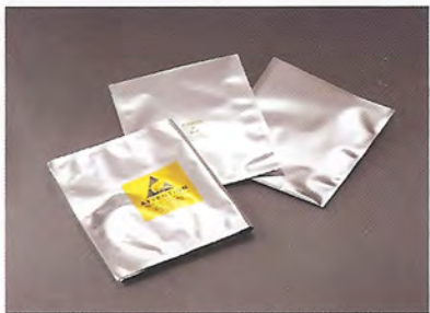
Moisture barrier bag