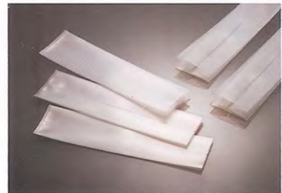
Cleanroom poly bag