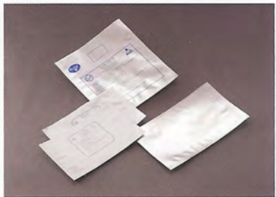
Aluminum foil bag