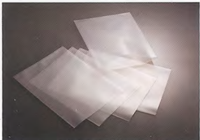
Cleanroom poly bag